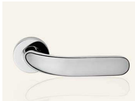
CR cromo lucido polished chrome