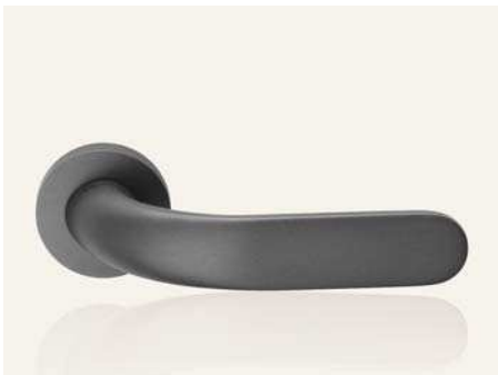
AS antracite satinato satin anthracite