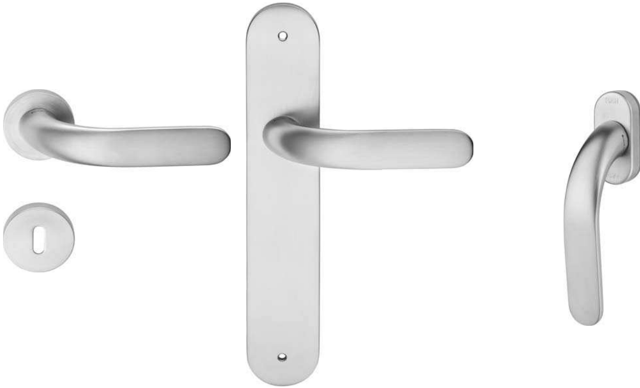
COD. 1595 RB 023