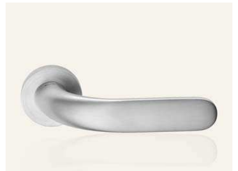
CS cromo satinato satin chrome