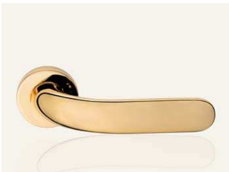
OZ oro zecchino gold plated