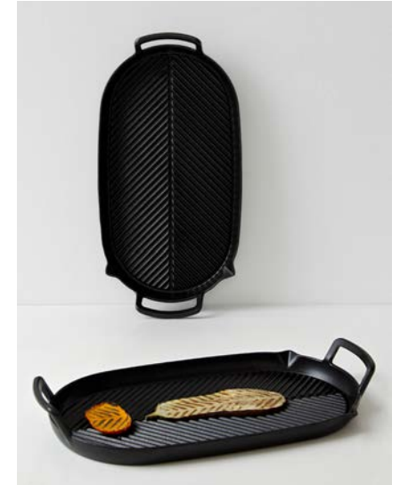
Herringbone, Crane (2017)