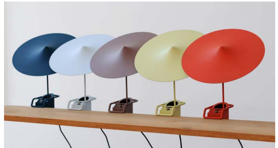
w153, Wästberg (2015)