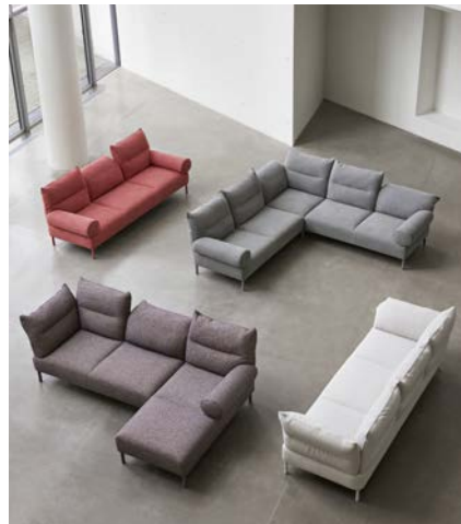
Pandarine, Hay (2020)