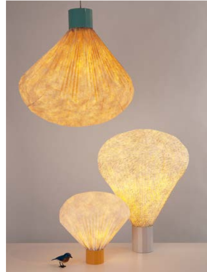
Lampes, Moustache (2012)

Born in Paris, she was a fellow at Villa Medici in 2000, at the Académie de France in Rome and opened her Paris studio in the same year. Her first collaborations were with Edra and Cappellini. Today she works with several French, Scandinavian and Italian companies, including HAY, Ligne Roset, Wästberg, Magis, Alessi, Luceplan, Mutina, Crane, Røros, Moustache, Svenskt Tenn, Gärsnäs.